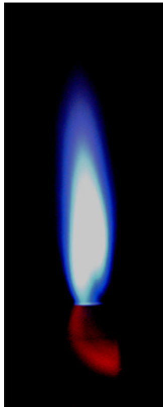
Nighttime photo – Same burner mounted vertically