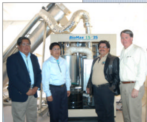
BioMax 15 at Zuni